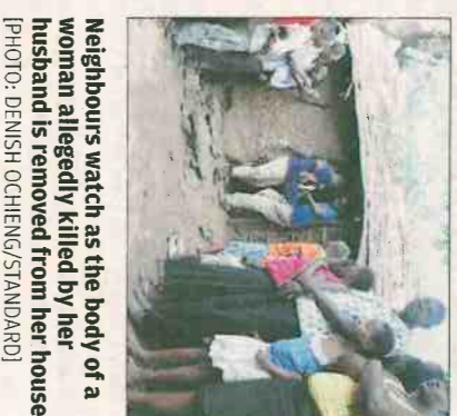
Neighbours watch as the body of a woman allegedly killed by her husband is removed from her house.